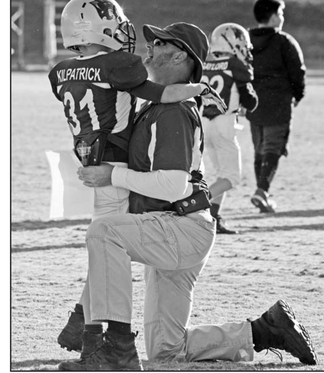
A postgame hug following Union County's victory.