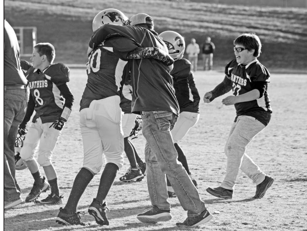
As the final buzzer sounds on the 2019 season, the Union County 9U Panthers race off the field to celebrate the Super Bowl win with teammates, coaches, parents, friends and fans.